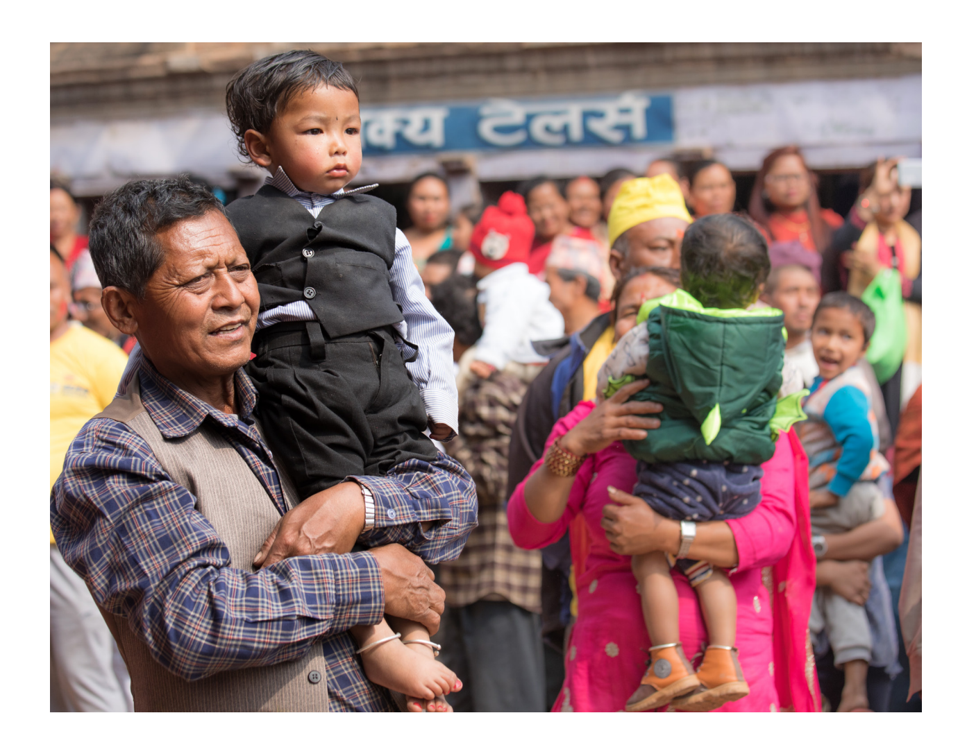
Below: A father and his child enjoy a passing ceremony procession in Kathmandu, Nepal.

The US$300-400 billion of official and private development assistance for the 59 LIDCs will be effective only if the funds are used responsibly. This report argues that an effective deployment of funds is indeed feasible along the lines demonstrated during the past 15 years by the pooled financing mechanisms such as the Global Fund to Fight AIDS, TB, and Malaria (GFATM) and the Global Alliance on Vaccines and Immunizations (GAVI). These pooled financing mechanisms have demonstrated how to pool donor funds effectively and how to manage the resulting outlays with professionalism and oversight (Sachs and Schmidt-Traub, 2017).