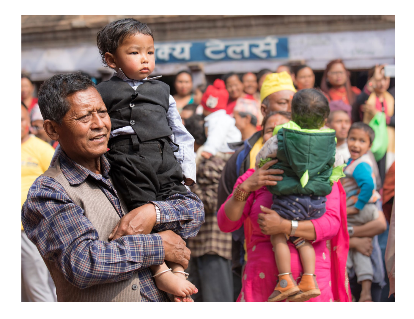
Below: A father and his child enjoy a passing ceremony procession in Kathmandu, Nepal.

The US$300-400 billion of official and private development assistance for the 59 LIDCs will be effective only if the funds are used responsibly. This report argues that an effective deployment of funds is indeed feasible along the lines demonstrated during the past 15 years by the pooled financing mechanisms such as the Global Fund to Fight AIDS, TB, and Malaria (GFATM) and the Global Alliance on Vaccines and Immunizations (GAVI). These pooled financing mechanisms have demonstrated how to pool donor funds effectively and how to manage the resulting outlays with professionalism and oversight (Sachs and Schmidt-Traub, 2017).